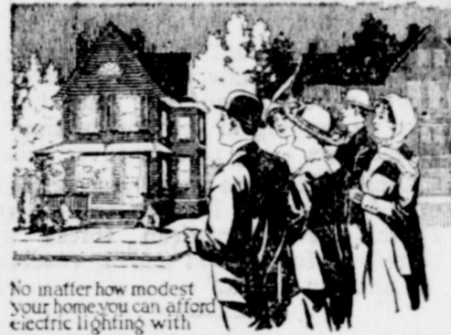
No matter how modest your home you can afford electric lighting with EDISON MAZDA LAMPS

LONG winter evenings will soon be here, the time when comfort and cheer are most welcome.