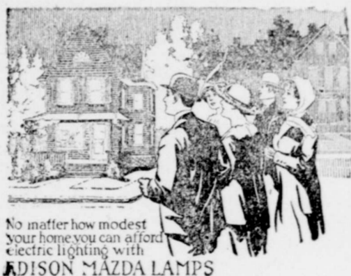
No matter how modest your home you can afford electric lighting with ADISON MAZDA LAMPS