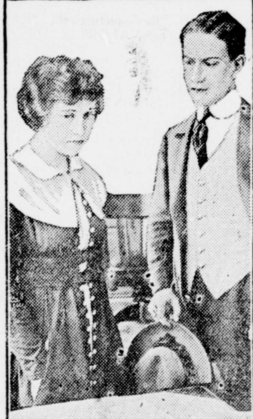
"I Am Interested in Settlement Work," He Explained.

One glance at the nearest ruffian told Burton how outrageously he had been swindled. Without a spoken word he leaped toward the door and endeavored