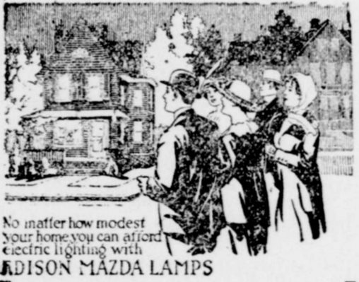
No matter how modest your home you can afford electric lighting with EDISON MAZDA LAMPS

LONG winter evenings will soon be here, the time when comfort and cheer are most welcome.