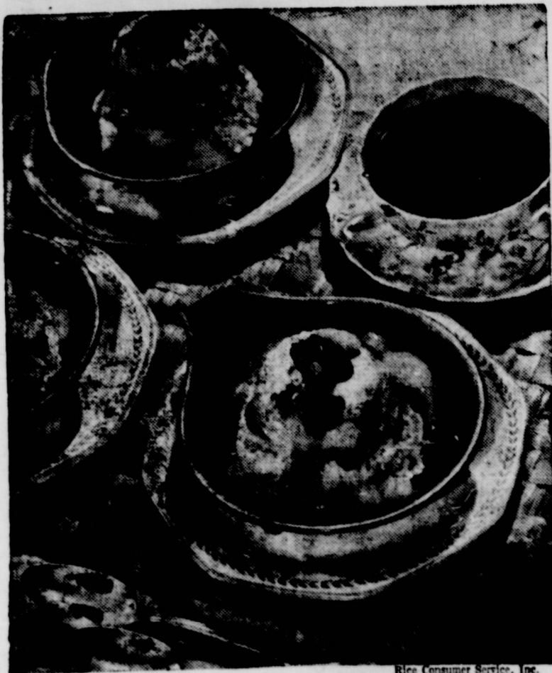
Rice Consumer Service, Inc.