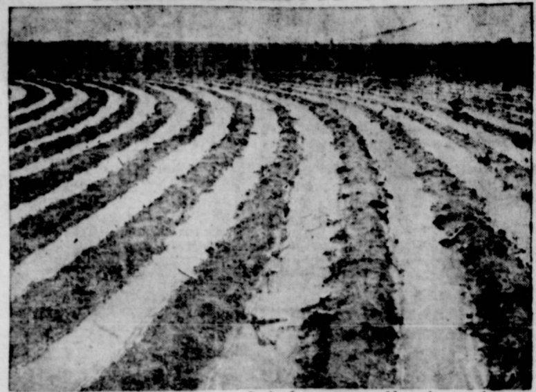
Contour farming on terraced lands holds the maximum rainfall in place for crop production and reduces soil loss resulting from run-off. A good vegetation program makes the above practices more effective.