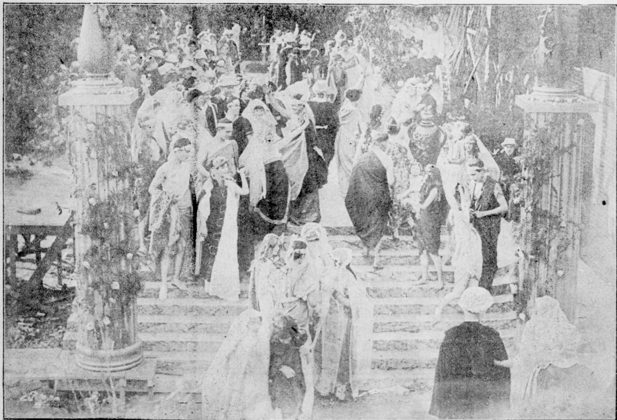
Allagorical Groups in scene in "The Birth of a Nation" at Queen Theatre Monday and Tuesday December 4th and 5th