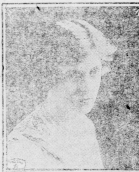
MABEL TALIAFERRO METRO STAR

Mabel Taliaferro, one of the most delightful stars of the screen world, will be seen early in the New Year in a new Metro-Columbia produc-