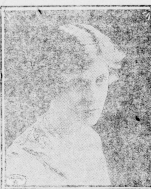
MABEL TALIAFERRO METRO STAR

Mabel Taliaferro, one of the most delightful stars of the screen world, will be seen early in the New Year in a new Metro-Columbia produc-