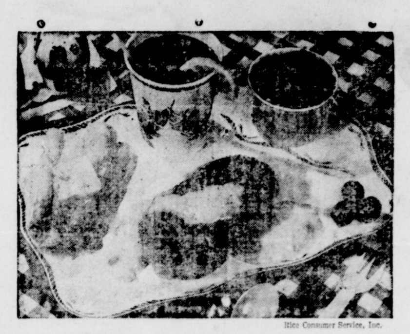
Easy TV Supper Features Chicken Cutlets With Cranberry-Apple Relish

Both the Chicken Cutlets and the Cranberry-Apple Relish for this TV Supper can be made ahead of time. At mealtime the Chicken Cutlets are fried to a piping hot golden brown while the sauce and the asparagus (or other favorite vegetable) are heating. Treat yourself to a real lazy and relaxing evening by serving this meal on paper plates or trays and end dish washing worries for the even-ing! You'll have fun fixing and serving this meal. You may want to treat your friends to this TV supper idea whenever they come around and you don't want to stay in the kitchen!