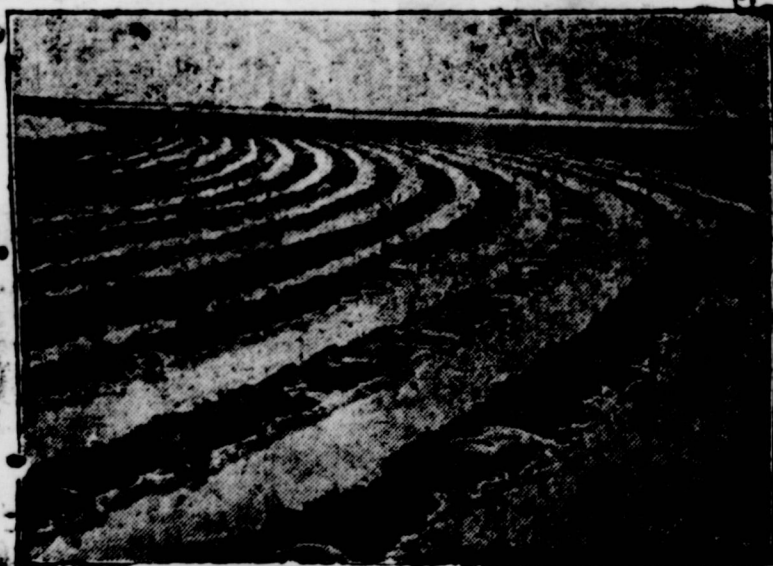
Farming on the contour and stable mucking helps to hold water where it falls

First National Bank Member F. D. I. C Gorman