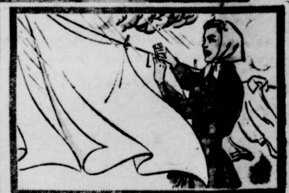
You can forget winter's cold and summer's heat... dry clothes in comfort any time... electrically!

You're freed forever from washday weather worries when you have an Electric Dryer. No more letting dirty clothes pile up while you wait for a change in the weather. No more shivering in icy winds or baking in the hot sun while you hang clothes on the line. With an Electric Dryer, you can dry clothes on schedule and in comfort... anytime. Your clothes will come out cleaner, softer and fluffier... dried in gentle electric heat... at the turn of a dial! Drying clothes electrically is one of the nicest things about living better... electrically.