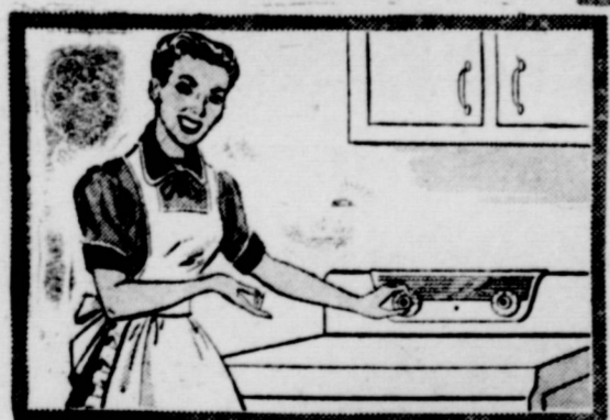
No matter how disagreeable the weather, you can dry clothes on schedule with an Electric Dryer