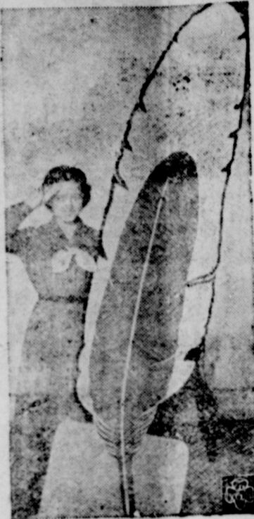
Girl Scouts all across the country salute the bigger Red Feather—symbol of the large scope of Community Chest activities made larger by the cooperation of all good citizens.