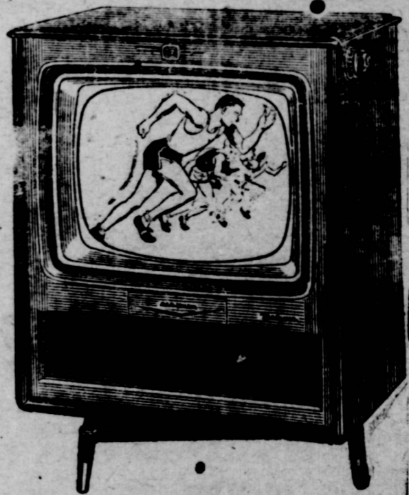
RCA Victor Ranstead Deluxe. Luxury swivel TV! 26 1/2 sq. in. of viewable "Living Image" picture. 3-speaker Panoramic Sound. 3 superb finishes: mahogany, blond tropical hardwood with natural walnut; birch. Model 21D74

We also do Butane installation for your new Butane service. Also install Butane conversion on your tractor or pick-up and do mechanic work on your car or tractor.