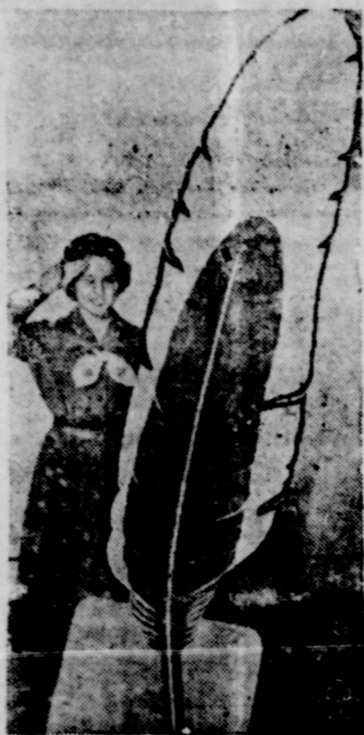
Girl Scouts all across the country salute the bigger Red Feather—symbol of the large scope of Community Chest activities made larger by the cooperation of all good citizens.