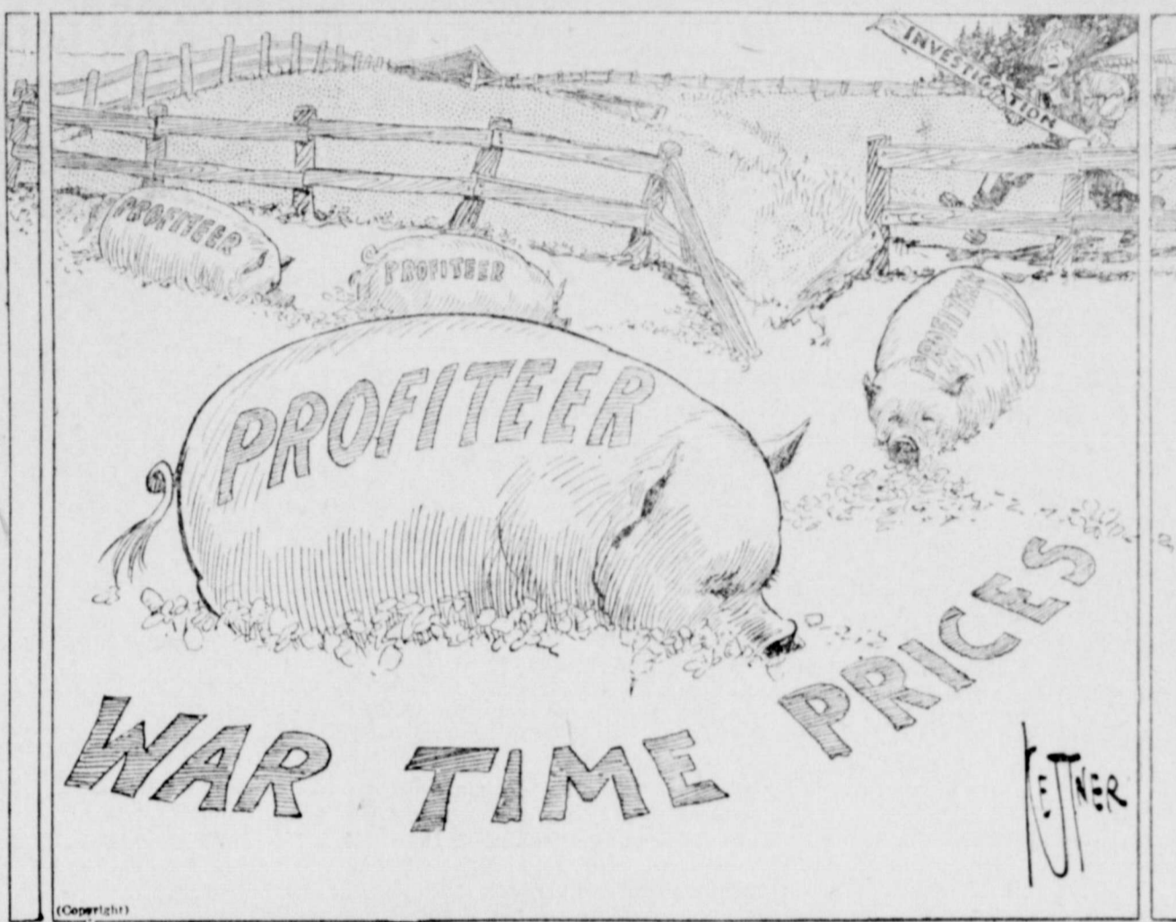
The Pigs are in the Clover

Chicago, July 30.—The official count of the dead in the recent race riots here was placed this afternoon at twenty-six.