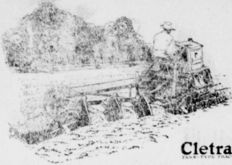
Cletrac TRACTION TYPE TRACTOR