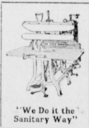
"We Do it the Sanitary Way"