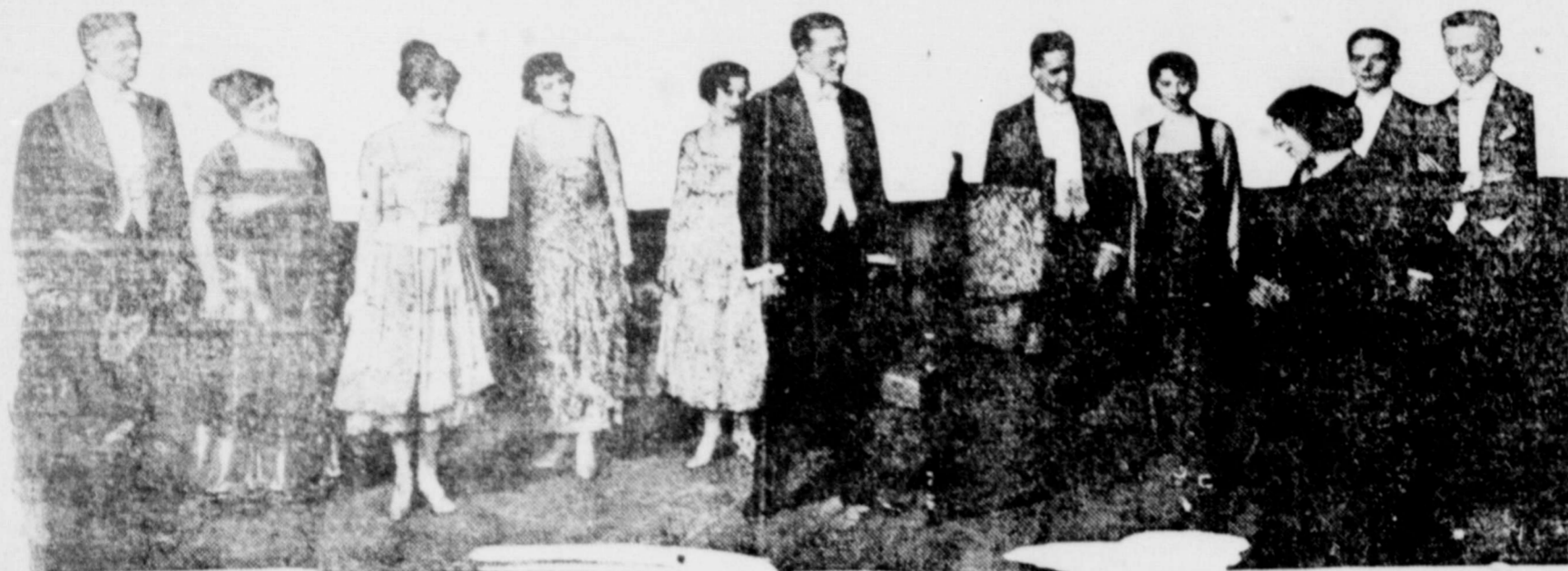
A Scene from "THE THIRTEENTH CHAIR."