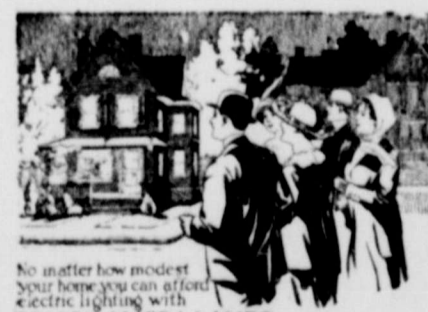
No matter how modern your home you can afford electric lighting with ADISON MAZDA LAMPS

Make your Home Attractive by its Lights It Won't Cost much and helps the looks of any home.