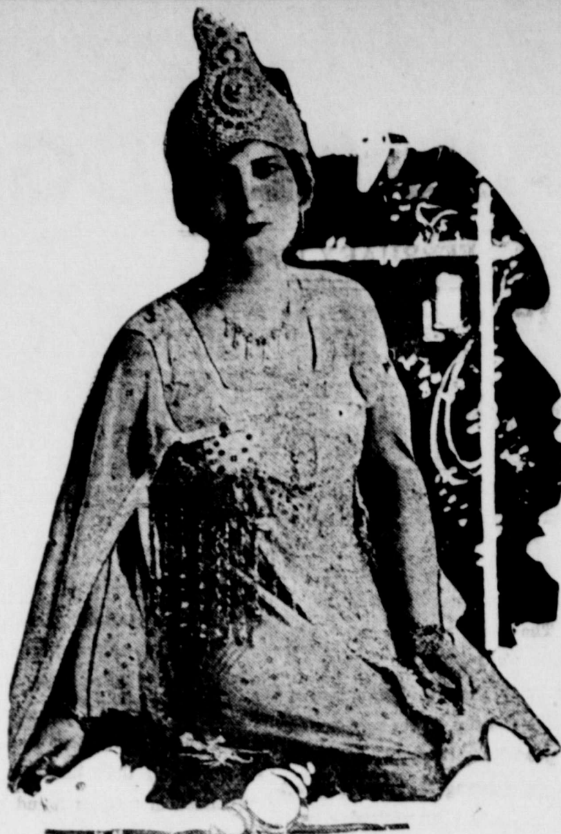
Princess of the Halder.

WANTED TO BUY —1000 or more acres close to water or river level suitable for irrigation pumping or otherwise. Give full description location, kind of soil. Kind of crops raised in that section, price, terms and all particulars in first letter, Address Edward H. Robinson, Brownsville, Texas. 10-4t eod