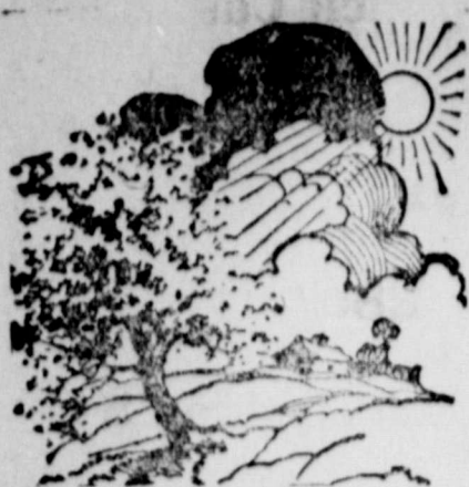
AFTER CLOUDS COMES SUNSHINE. AFTER DESPENCY COMES JOY. AFTER SICKNESS COMES HEALTH. AFTER WEARINESS COMES STRENGTH.

In the spring when you're "all in"—fagged out—blood thin, if you will turn to Nature's remedy, a tonic made from wild roots and barks, which has stood fifty years as the best spring tonic—you will find strength regained. No need to tell you it's Dr. Pierce's Golden Medical Discovery, put up in tablet or liquid form, and sold by every druggist in the land. After a hard winter—shut up indoors, your blood needs a temperance tonic, a tissue-builder and blood-maker such as this "Medical Discovery" of Dr. Pierce's.