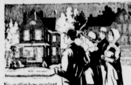
No matter how modest your home you can afford electric lighting with ADISON MADZA LAMPS

Make your Home Attractive by its Lights It Won't Cost much and helps the looks of any home.