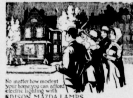
No matter how modest your home you can afford electric lighting with ADISON MADZA LAMPS

P. S.—Complete stock of Jenkins Vulcan Springs 25 per cent Off List.