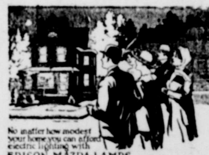
No matter how modest your home you can afford electric lighting with MADISON MAZDA LAMPS