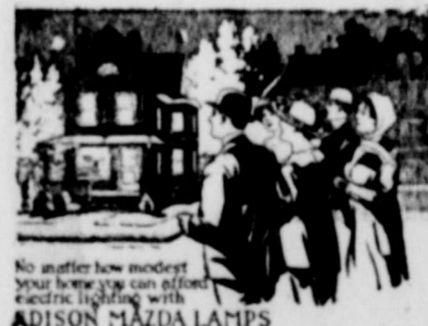
No matter how modest your home, you can afford electric lighting with ADISON MADZA LAMPS

Make your Home Attractive by its Lights. It Won't Cost much and helps the looks of any home.