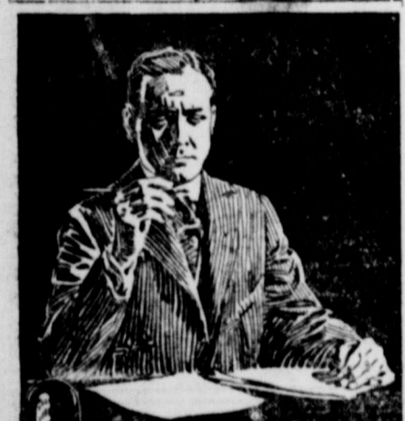
5.30 at the Office— one letter left from the poised steel pen falls a drop of ink—that letter misses the mail.

Wool Hose—they are the newest. Van Pelt-Pyburn. 22-2d