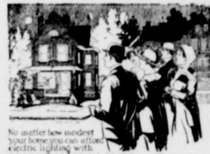
No matter how modern your home you can afford electric lighting with ADISON MADZA LAMPS

Make your Home Attractive by its Lights It Won't Cost much and helps the looks of any home.