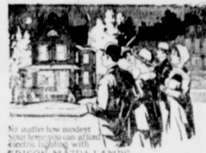
No matter how modest your home you can afford electric lighting with ADISON MADZA LAMPS

Make your Home Attractive by its Lights It Won't Cost much and helps the looks of any home.