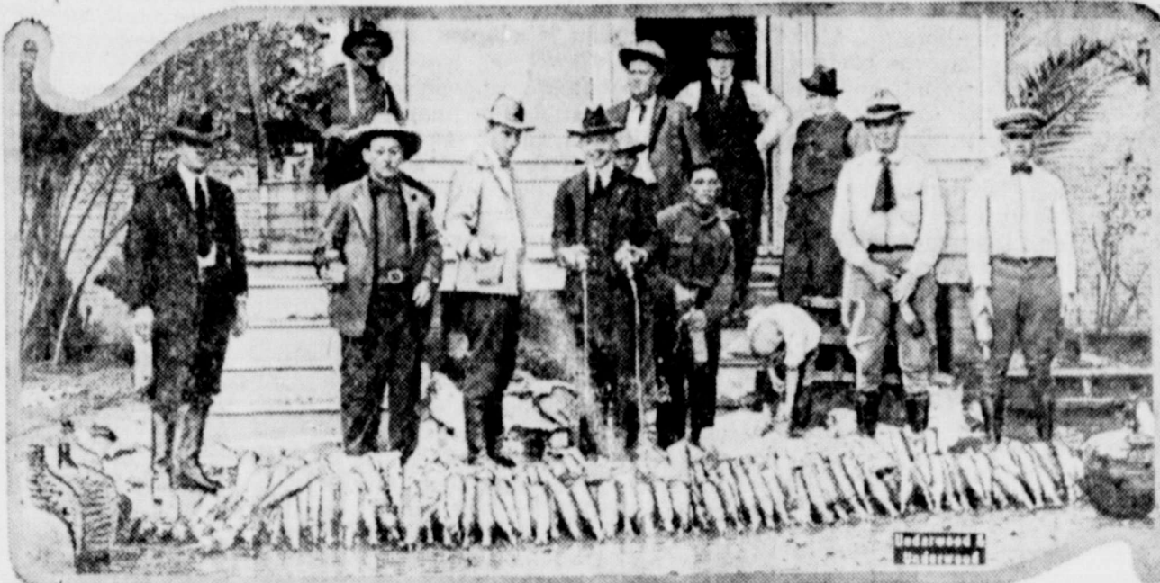
Federal agents disposing of a quantity of Mezcal and Tequila, smuggled across the border into Brownsville, Texas, and seized with the co-operation of the Texas rangers.