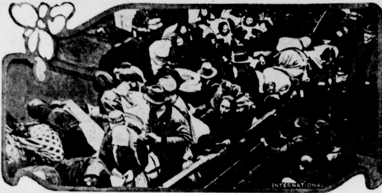
Having been penned up in Russia and Poland during the war, suffering untold hardships, these Poles and Czech-Slovaks, are boarding the Adriatic at Southampton, England, on the last leg of their journey to America.