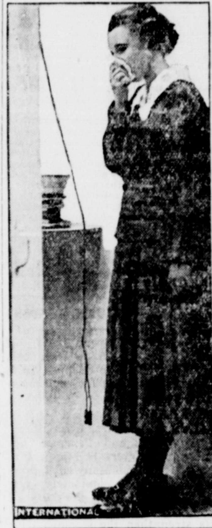
Wellesley college girls are being rendered sneezeless snuffleless and almost immune to colds by means of a "eozysa closet." When a girl feels the twitching of nose that heralds the coming of a sneeze or is otherwise warned by nature that she is catching cold, she dashes for the closet. It is a zinc-lined, airtight compartment, and there she inhales disinfecting fumes of formaldehyde and eucalyptus oil.

"Once a cold is contracted the best conditions for rapid recovery are complete rest and rapid elimination of bacterial poison by use of laxatives. Prompt local medication under a physician's direction may shorten the duration of the disease, diminish the discomfort and incidentally lessen