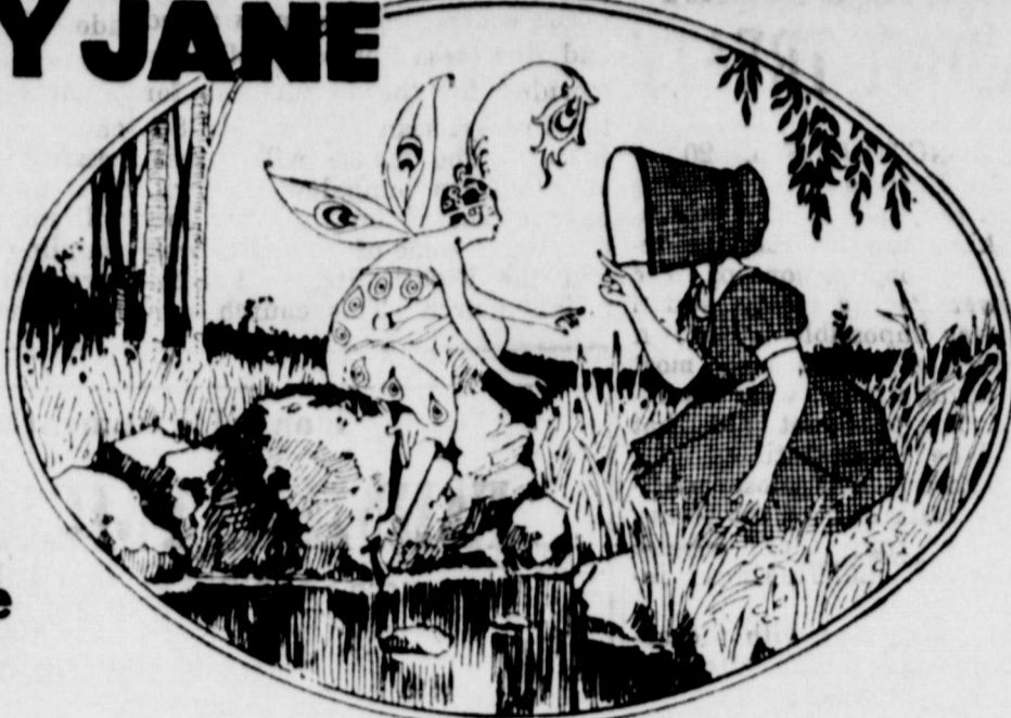
"I'm going to tell you the greatest secret in the world" the Queen says to Mary Jane.

The Queer of the Fairies Tells Mary Jane a Secret