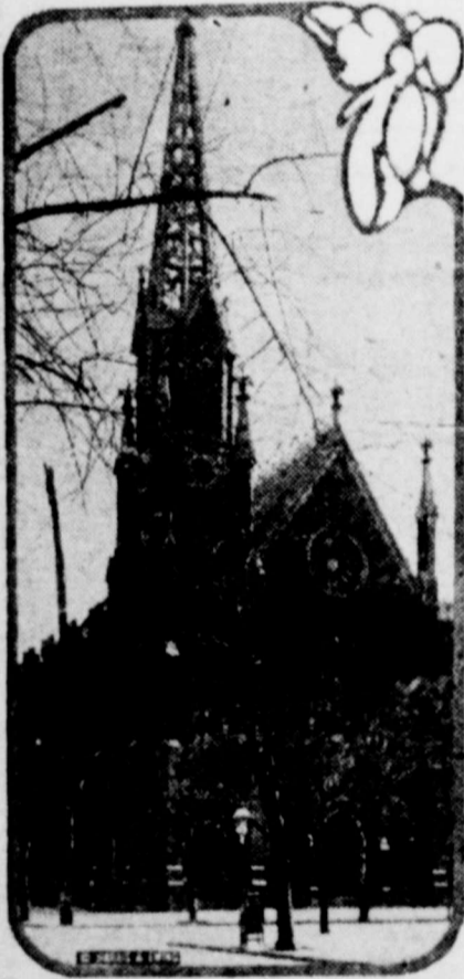
This is the Calvary Baptist church, Washington, where it is expected President Harding will attend. He worshipped there as senator.