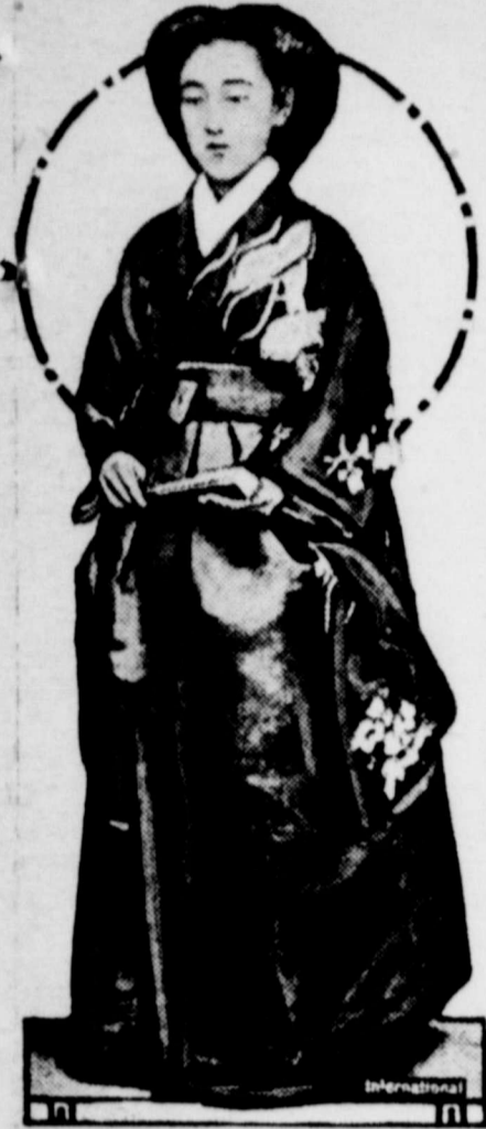
Princess Nagaka, daughter of Prince Kuni of Japan, whose engagement to wed Crown Prince Hirohito, has been officially announced.