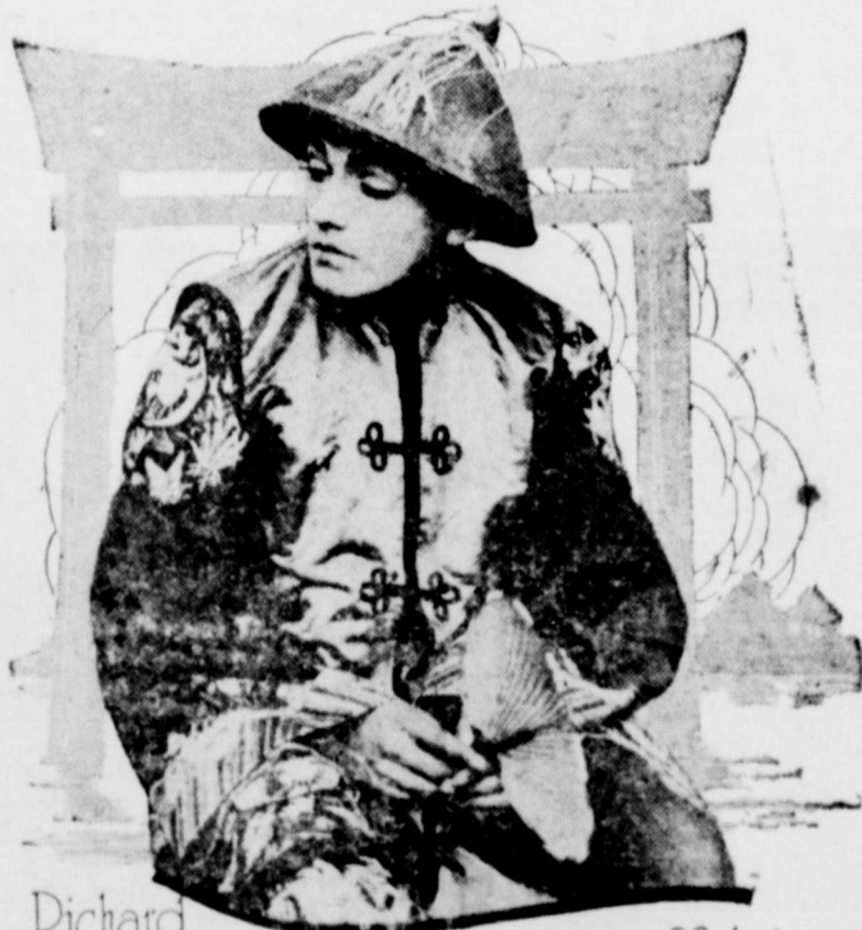
Richard Barthelmess as The Chick in DW Griffith's "Broken Blossoms"