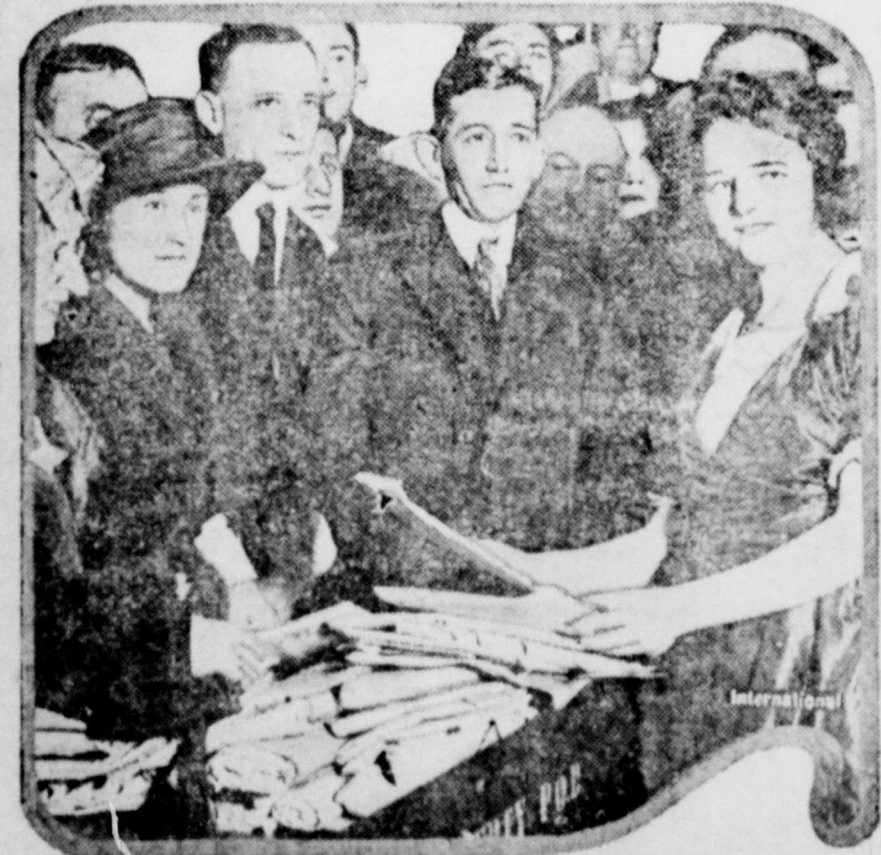
Postmaster General Hays is making inspection visits to the big cities... of "a square deal" to postal employees. The photograph showing department of the New York postoffice, National Republican committee, made a reputation and harmonizer.

Numerous favorable replies were being received from members of the Executive Board of the West Texas Chamber of Commerce in response to the