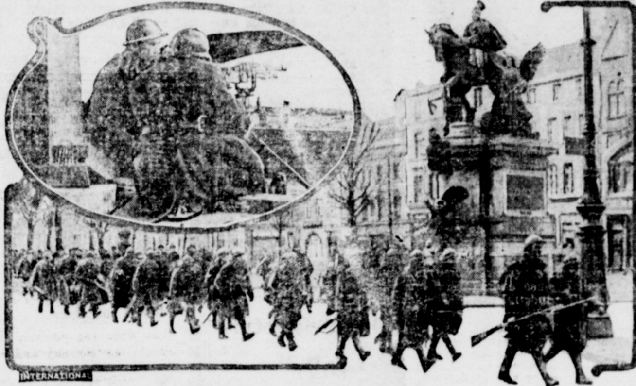
Belgian troops marching past the Frederiek statue in Dusseldorf to occupy this important German city in the Rhine territory. Insert—A French machine gun on the famous Dusseldorf bridge.