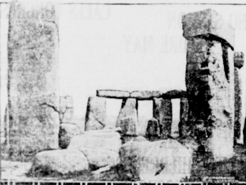
At Stonehenge the tremendous trilithons are now freed from scaffold. The stones seemed tottering to a fall. Engineers set to work to repair the damage. The rumbling drills and derricks no longer disturb the peace of the Wiltshire meadows.