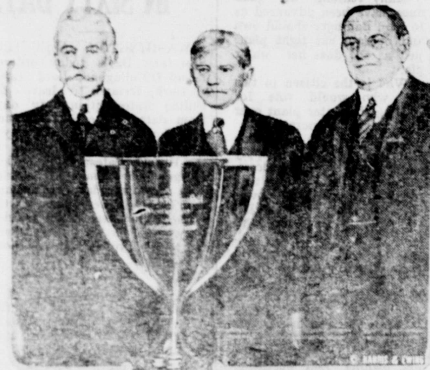
Ex-Vice President Marshall with the silver loving cup presented to him by the senate, photographed with the Republican and Democratic leaders Senator Lodge (left) and Underwood (right).