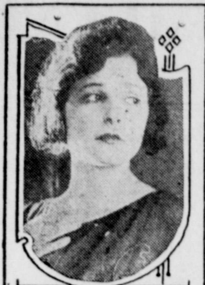
NORMA TALMADGE IN 'THE BRANDED WOMAN'

Norma Talmadge plays the part of a runaway wife in her latest First National picture, "The Branded Woman," which is being shown at the Maeroy Theatre today and tonight. How a baby figures in straightening out a maze of domestic entanglements via the telephone is revealed in the film version of this fascinating play.