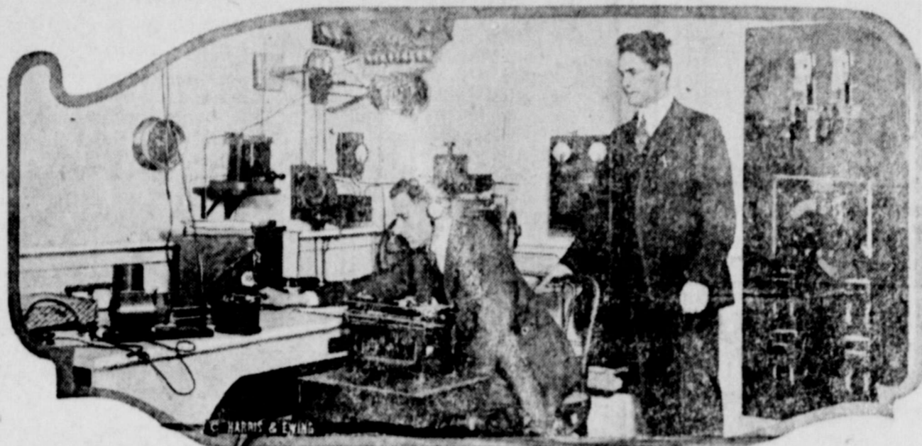
Government owned and operated, the wireless equipment installed on the eighth floor of the postoffice department building in Washington is employed in the twofold function of giving information in connection with the operation of the coast-to-coast air-mail service and in sending out the market reports of the department of agriculture to the farmers of the country.