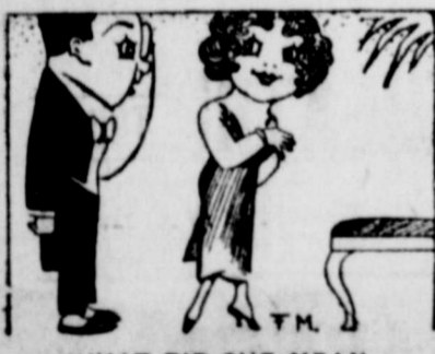
WHAT DID SHE MEAN

The exchange of greeting cards, though now such a recognized part of Christmastide ceremonial, is a custom of quite recent origin.