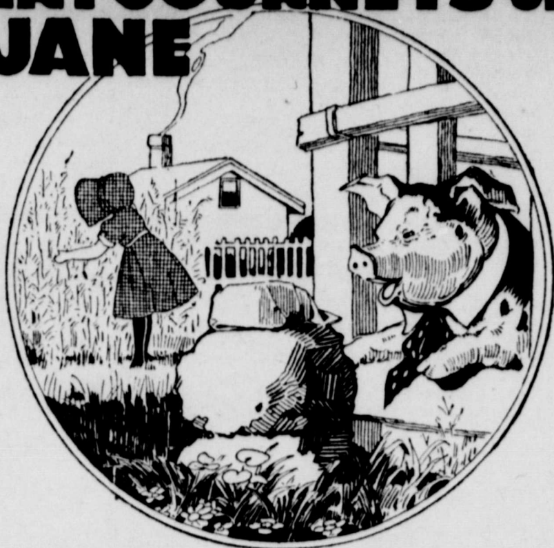
Hungry Henry had a wonderful appetite—nobody ever had to coax him to eat.

How Hungry Henry Stole Mary Jane's Lunch