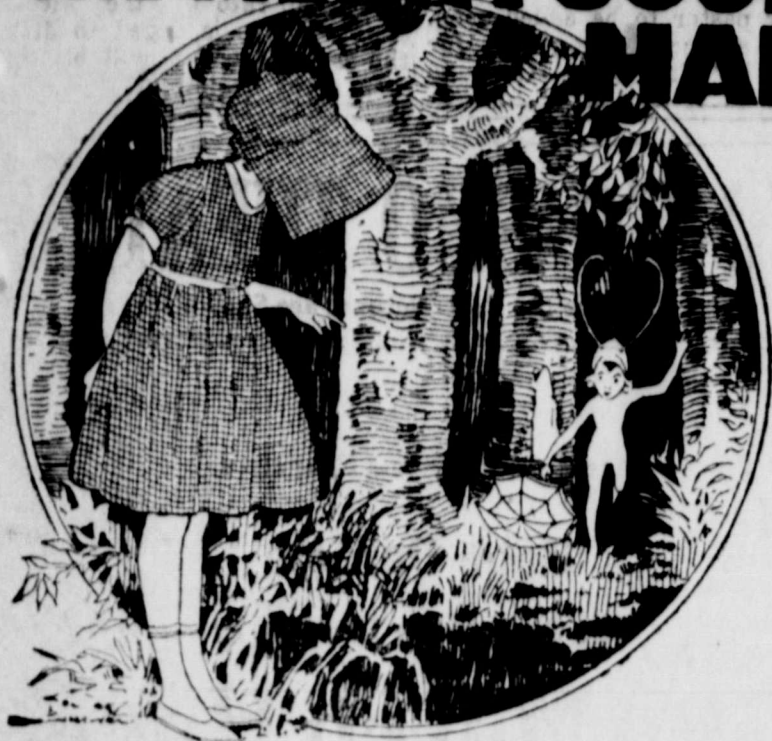
He told Mary Jane all about the elves and the fairies and about the moonlight night in June.