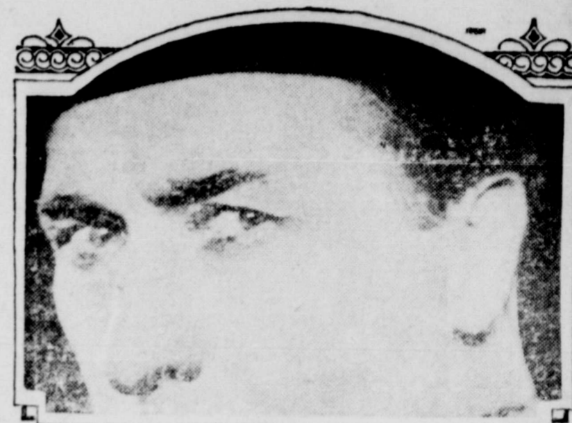
William S. Hart in "O'Malley of the Mounted" A Paramount Picture