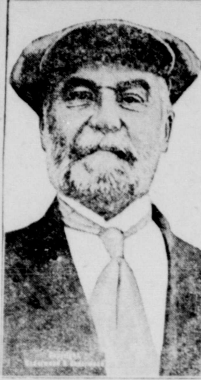
Photo of Peter Verigin, acknowledged leader of the Doukhobors (a Russian religious sect) of western Canada. According to newspaper reports, Verigin has proposed that children of less than ten years of age, the aged and the infirm be tossed into the Columbia river—just to enable the Doukhobors more easily to dispose of their property and wander about the country in vagrant bands, as is being followed in San Angelo at present.

On several previous occasions the Doukhobors have staged nude parades, both of young children and adults, sometimes in bitter winter weather.