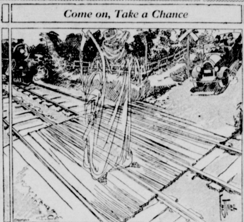
Come on, Take a Chance