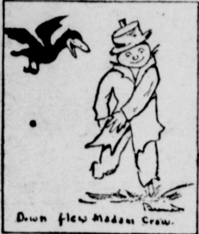
Down flew Madam Crow.

There was no reason for her to give anyone warning that Mr. Fox was around, for there was no one in sight but Madam Crow, who had rather a bad disposition and a sharp tongue, so when she saw Mr. Fox she gave