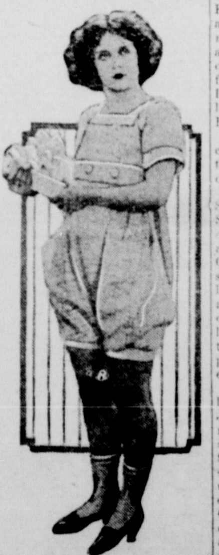
VIOLA DANA In a costume she did not wear on the train taking her back to the sequestered life of Hollywood.