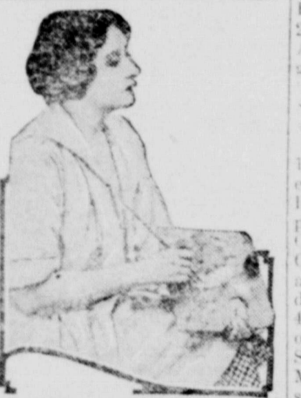
CLARA KIMBALL YOUNG A Painter of No Mean Ability. She Finds at Her Easel Relaxation From the Hard Work Before the Camera.

New typewriter ribbons, for different machines, at Ballinger Printing Co. dtf