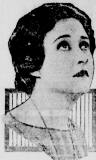
CLARA KIMBALL YOUNG