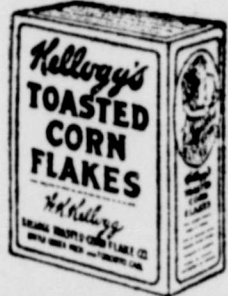
Also makers of KELLOGG'S KRUMELS and KELLOGG'S BRAN, cooked and krumbled

Kellogg's Corn Flakes are sold only in the RED and GREEN package bearing the signature of W. K. Kellogg, originator of Corn Flakes. None are genuine without it!