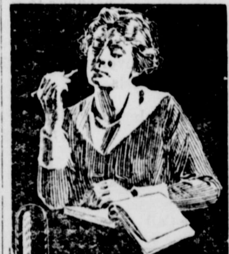
Taking Dictation —her pencil breaks. There is delay—embarrassment. She is the sufferer—the fault is the pencil's.