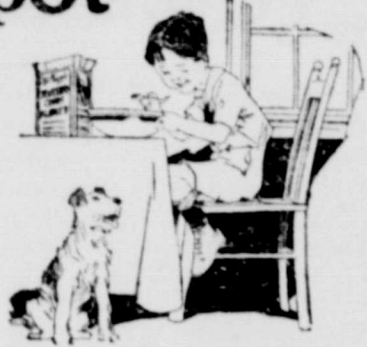
"Bobbie dog, guess it makes you hungry, too, to see me eat a great big bowl of Kellogg's for breakfast every morning! But I can't spare any today, Bobbie; honest I can't!"

Kellogg's Corn Flakes touch-the-spot any hour of day or night