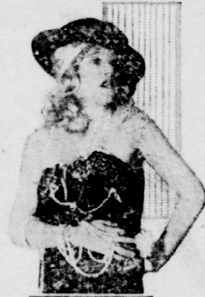
MAE MURRAY Who is Making Her New Picture, "Coronation," in Hollywood.

Jad Salts is inexpensive; cannot injure; makes a delightful effervescent lithia water drink, which everyone should take now and then to help keep their kidneys clean and active. Try this; also keep up the water drinking, and no doubt you will wonder what became of your kidney trouble and backache.