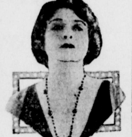
CLARA KIMBALL YOUNG Her popularity with photoplay fans increases with each succeeding picture. Her latest vehicle is "The Woman of Bronze."

The mayor of Caruthersville, the county seat of Pemisicott county, said that he did not believe there would be any violence, while the district attorney stated that he was without jurisdiction and that it was purely a state matter, and one which the state authorities must deal with.