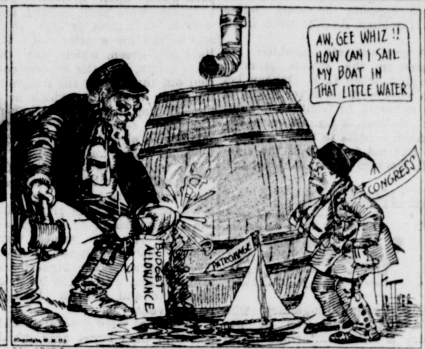
The Ol' Rain Barrel