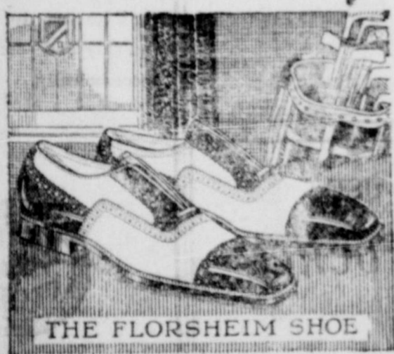
THE FLORSHEIM SHOE