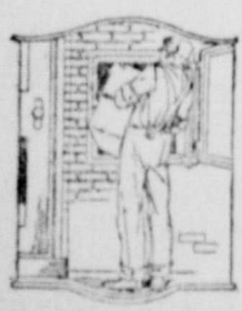
Outside icing conserving and 26 other Herrick features described in free book

The Herrick Refrigerator has won its many prizes partly because of its Five-Point Mineral Wool Insulation noted for these features: (1) positively air-tight and weather-proof; (2) most successful non-conductor of heat and cold; (3) never sags, shrinks nor settles; (4) permits no animal life; (5) cannot decay, mildew nor deteriorate.